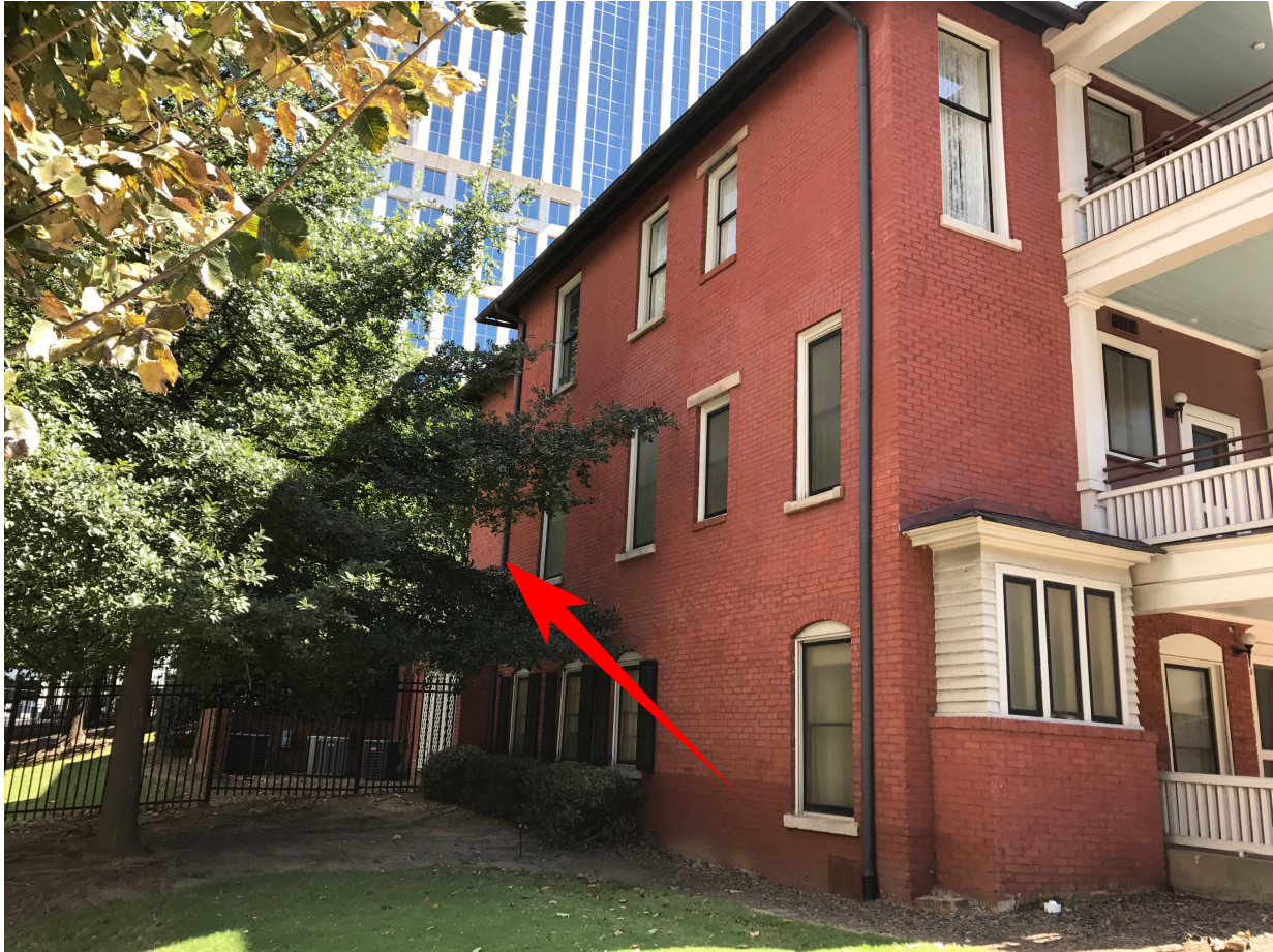
Tree touches house